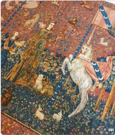
141 An Aubusson wall hanging by Robert Four depicting 'la Dame a la Licorne' (The Lady and the Unicorn), maker's label to the reverse, 130 x 200 cm £200 - £300