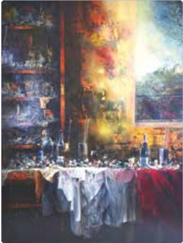
François D'Izarny (French, b. 1952), 'Mon Atelier a Touet-sur-Var', signed and dated 2002, mixed media on canvas, image 162 x 130 cm