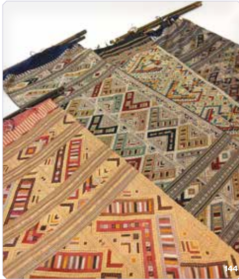
144 A group of four 20th century South East Asian silk wall hangings including one by Lao Textiles (4) £150 - £200