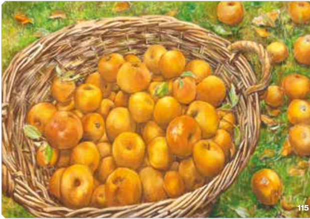
115 Clare Leeder (contemporary), A basket of quinces, signed and dated 2000 verso, oil on canvas, 74 x 110 cm £150 - £200